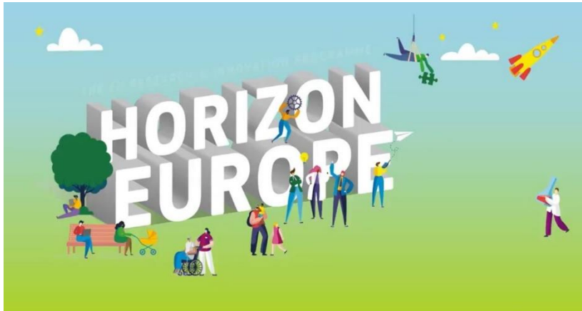
EU's Framework Programme for Research and Innovation