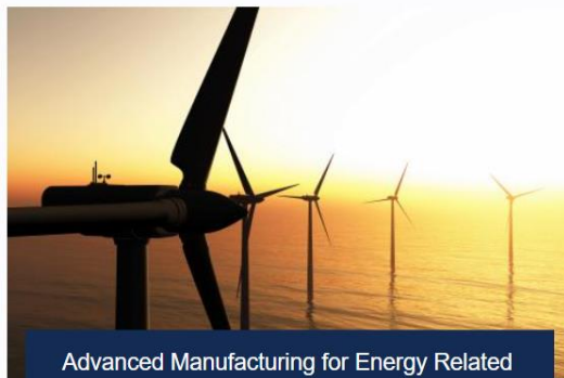
Advanced Manufacturing for Energy Related Applications in Harsh Environments