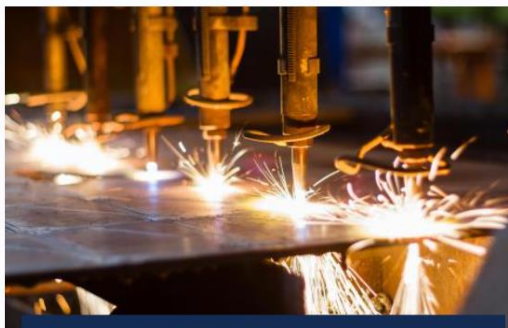
Efficient and Sustainable Manufacturing (ESM)