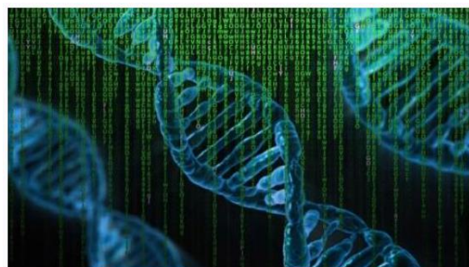
Smart Health/ Personalised Medicine