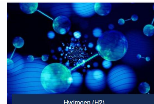
Hydrogen (H 2 )