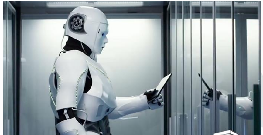
Science, 03.26.19, Robot 'Natural Selection' Recombines Into Something Totally New

Gen-Z might not be into potatoes much but they sure must be developing some other mental capacities.