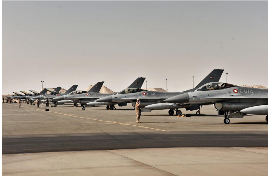
File photo showing Danish F16 fighter aircraft in Kuwait.

The Danish armed forces is looking to gamers to bolster its ranks of pilots, flight commanders and radar operators.