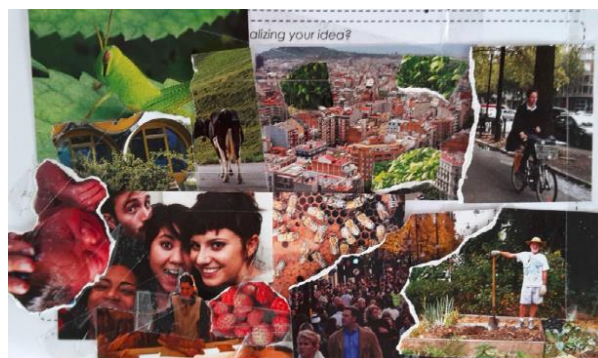
Collage made from citizens at one of the consultations