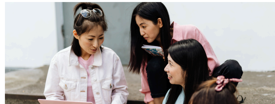
Youth and Women Empowerment