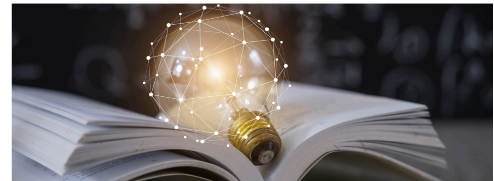
a Euro–Mediterranean Higher Education Area