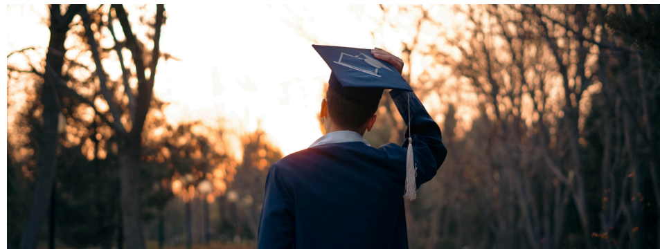
Strengthening University Alliances