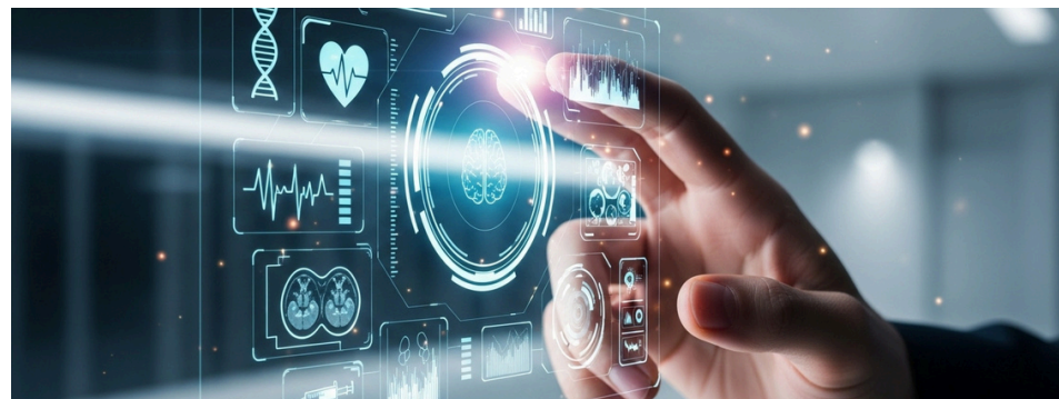
Research & Innovation