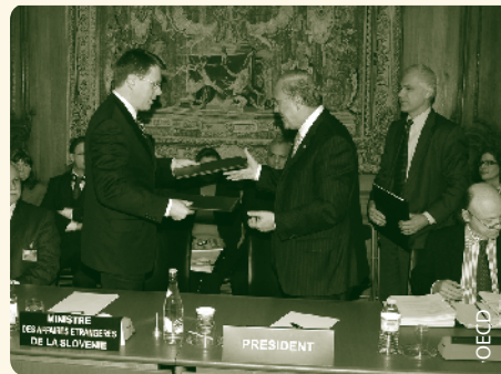
Samuel Zbogar, Slovenian Minister for Foreign Affairs, and OECD Secretary-General Angel Gurría

In January, OECD Secretary General Angel Gurría said in a public statement, that he expected Slovenia to join the organisation as early as May 2010. Prime Minister Borut Pahor welcomed this statement by saying that "Slovenia will make a full circle of integration into international institutions." Slovenia is to join the organisation as its 33rd member. It was invited to start negotiations in 2007 along with Estonia, Russia, Chile and Israel.